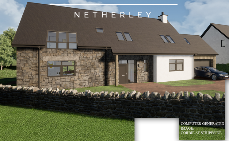
COMPUTER GENERATED IMAGE: CORBIE AT STRIPESIDE